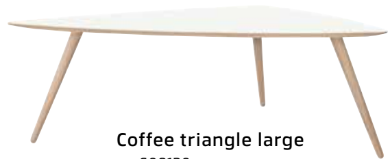
Coffee triangle large no 608120