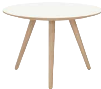
Coffee D60 no 608060