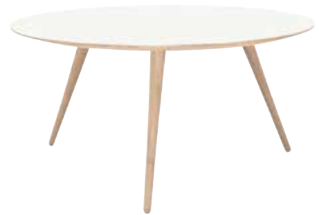
Coffee D90 no 608090