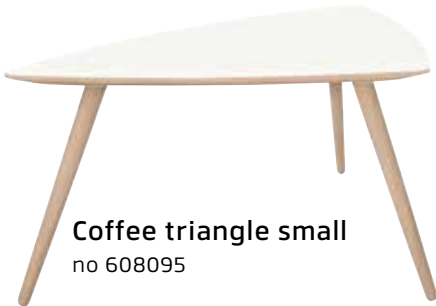
Coffee triangle small no 608095

The Stick has solid wood legs and fits both into the small apartment and into the spacious living room. The Stick work desk and it's trendy, contemporary design has got all the features required for a functional work desk where everything can be packed away when the job is done.