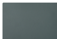
505 Verde modo

The paper used for this brochure is FSC® certified.