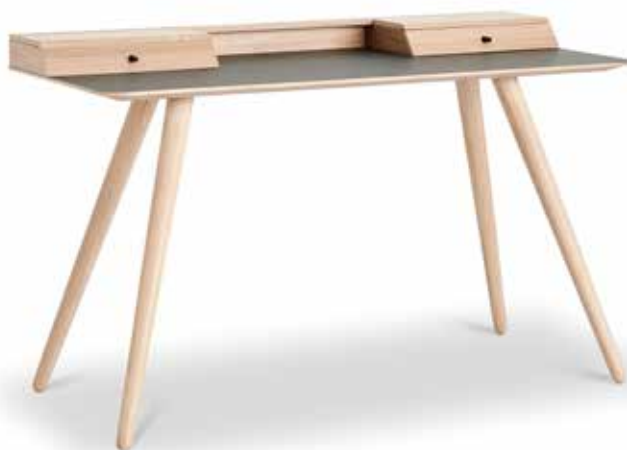
Desk no 708136

Desk with removable tray drawer and cable flap. Drawer fronts are wood as standard