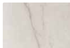
301 yule white