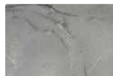
302 Yule grey