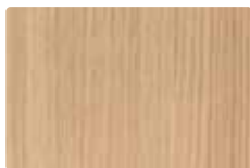
043 Light oak lac