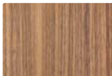
075 Walnut oil