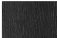
087 Black oak lac