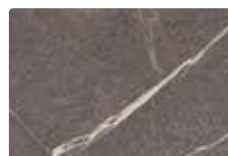
304 Pulpis dark